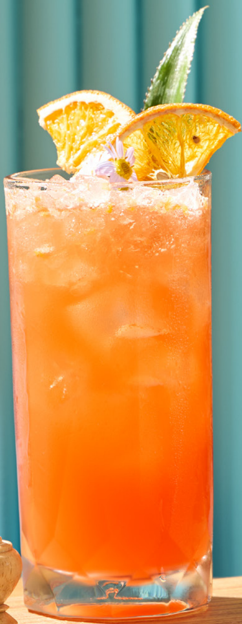
The Shore Punch Orange juice, Pineapple juice, Grenadine Lemon juice